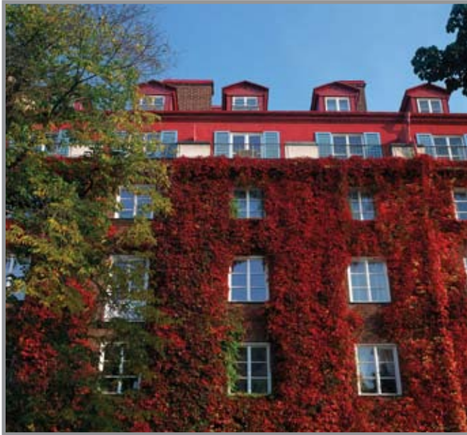
Residential Apartment Buildings

Professional property management at your service.