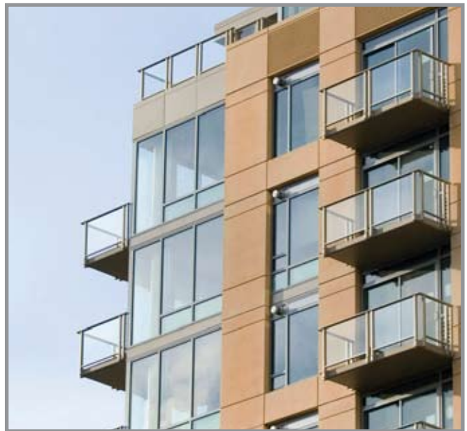
Luxury Strata Properties

Go with Macdonald Commercial and leave the management to us.